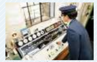
The hoist is controlled from the operator's room.