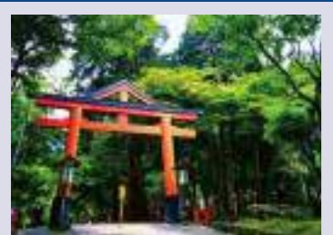
Hiyoshi Taisha Shrine