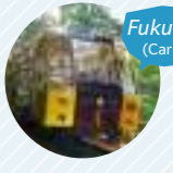
Fuku-go (Car 2)