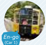
En-go (Car 1)