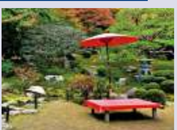
Kyu Chikurin'in Garden