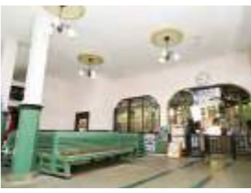
The station's interior features retro-style colors and a nostalgic Taisho vibe.