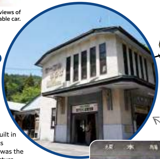
A sign bearing the station's original name can be seen at the entrance.

Board the cable car in Sakamoto, which flourished in the vicinity of Enryaku-ji Temple. The Western-style station, which occupies a two-story wooden building built in 1925, gained popularity for its adoption of what at the time was the most recent Western architecture style. The building was registered with the Japanese government as a Tangible Cultural Property in 1997.