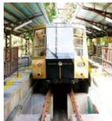
The platform offers head-on views of the cable car.