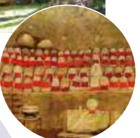
Stone Buddha figures (Horaioka Jizo statues)